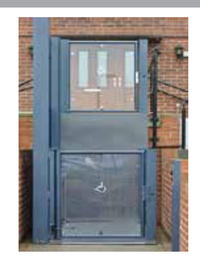
Other lifts available from the Wessex range