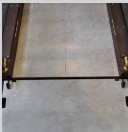
Special Floor Covering