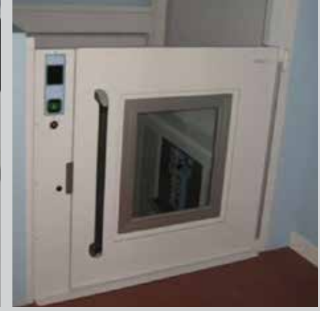
Half Height Gate at Upper Level