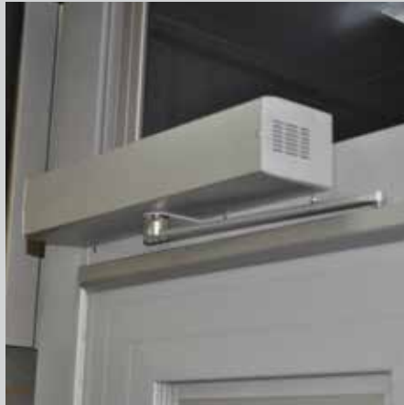
Power Operated Doors