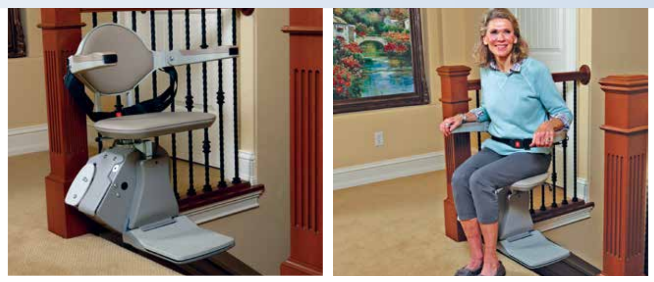
Offset swivel seat makes getting on/off easy.