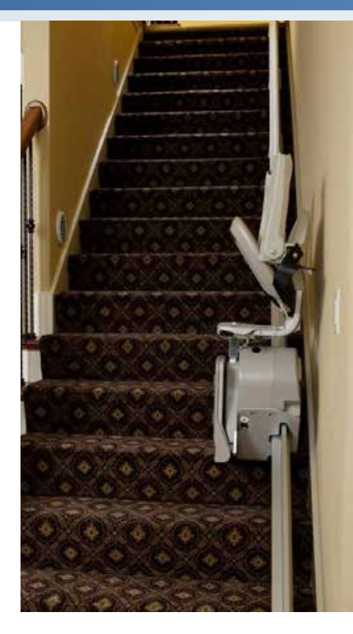
Compact, flip-up design for plenty of open space on stairway.