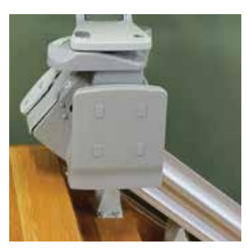
Power folding footrest automatically flips up/down when seat is raised/lowered. Arm switch control optional.